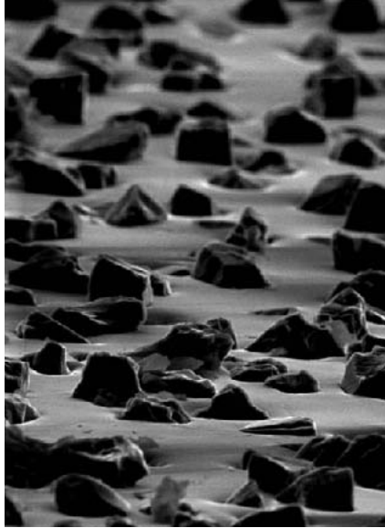
Surface structure of EKagrip® friction shim

Shims with friction-enhancing coating based on electroless nickel with embedded hard particles.